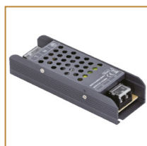
Zasilacz modułowy 100W Modular power supply 100W