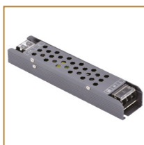
Zasilacz modułowy 60W Modular power supply 60W