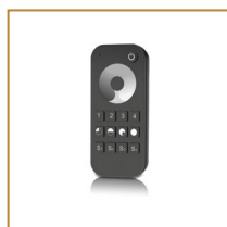
Pilot do taśm jednokolorowych Remote for single colour LEDstrips