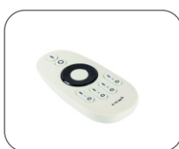
art.no: DIMMER 2.4G 4-ZONES ROTATING WHEEL RF