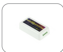
art.no: DIMMER 2.4G RECEIVER SINGLE COLOR