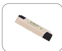
art.no: PS-ME-60W12V5A 1581