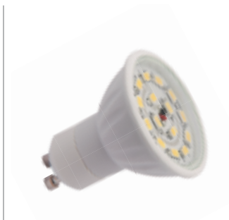
LED15 SMD C GU10-CW