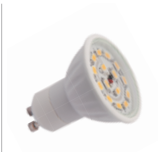
LED15 SMD C GU10-WW