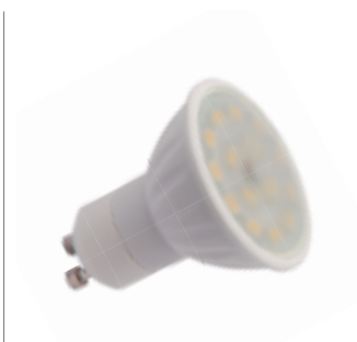
LED15 SMD C GU10-WW/F