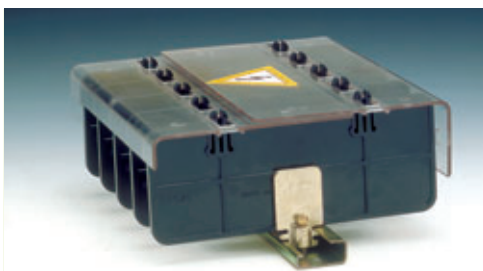
(*) vertical dimensions including rail

For protection against accidental contacts or tampering of CDA, ACB series terminal blocks. Of self-extinguishing and transparent material, 2.3 mm pitch and 200 mm standard length (corresponding to a total width of four adjacent terminal blocks).