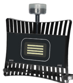
50W 200x180x12 mm (LxWxH) PF041954