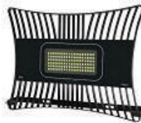
100W 238x260x12 mm (LxWxH)