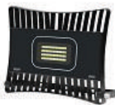
50W 200x180x12 mm (LxWxH)