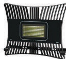
150W 278x252x14 mm (LxWxH)