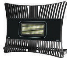
200W 295x330x16 mm (LxWxH)