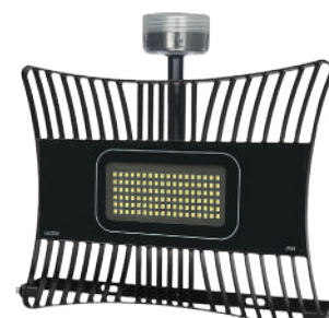
100W 238x260x12 mm (LxWxH) PF041961