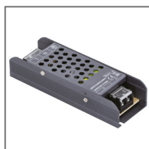
Zasilacz modułowy 100W Modular power supply 100W