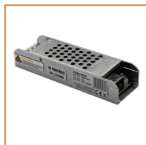
Zasilacz modułowy Graphite 100W Modular power supply Graphite 100W