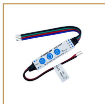
Sterownik do taśm RGB RGB LED strips controller