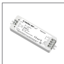
Sterownik do taśm jednokolorowych Single colour LED strips controller