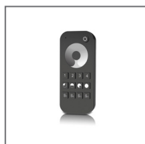
Pilot do taśm jednokolorowych Remote controller for single colour LED strips