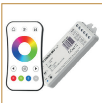
Zestaw SKY RGBW (pilot+sterownik) SKY RGBW Controller Set (remote+receiver)