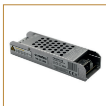
Zasilacz modułowy Graphite 100W Modular power supply Graphite 100W