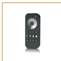
Pilot do taśm jednokolorowych Remote controller for single colour LED strips