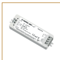
Sterownik do taśm jednokolorowych Single colour LED strips controller