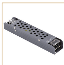
Zasilacz modułowy Graphite 60W Modular power supply Graphite 60W